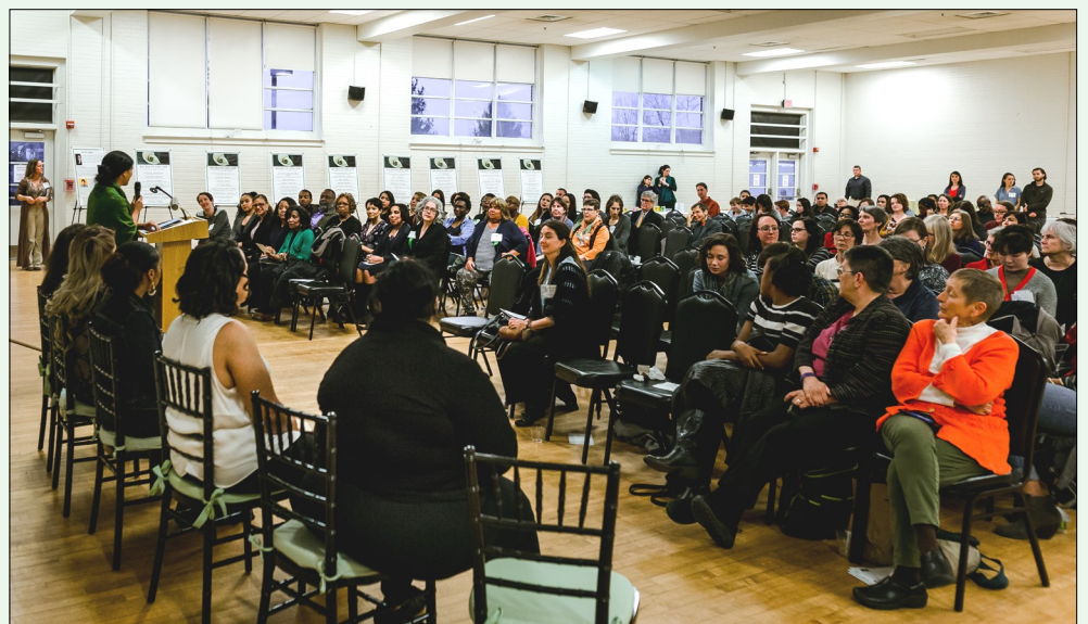
Two hundred people gathered at Carver Recreation Center in March to hear women's stories of growth and renewal, a part of the Virginia Festival of the Book.

"...She came from the war The war that dislocated her family She remembered the bodies being piled on top