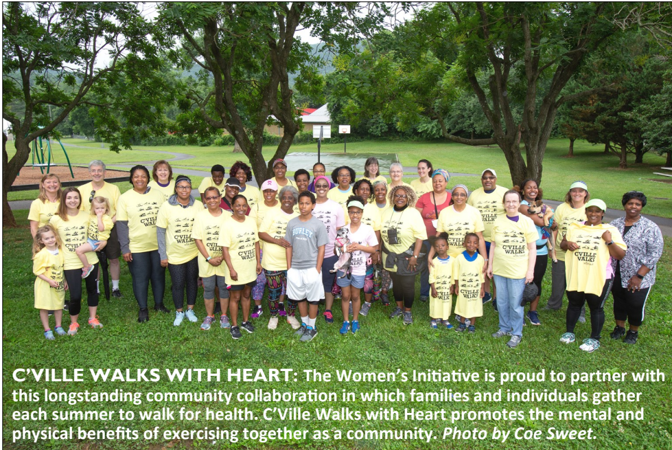
C'VILLE WALKS WITH HEART: The Women's Initiative is proud to partner with this longstanding community collaboration in which families and individuals gather each summer to walk for health. C'Ville Walks with Heart promotes the mental and physical benefits of exercising together as a community.